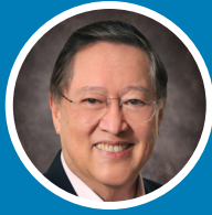
CARLOS G. DOMINGUEZ Secretary, Department of Finance, Philippines