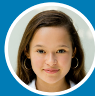
MELATI WIJSEN Founder, Bye Bye Plastic Bags and YOUTHTOPIA Voices