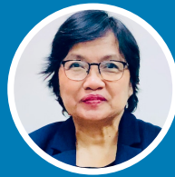
MYRNA C. CABOTAJE Undersecretary, Department of Health, Philippines