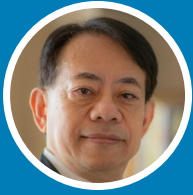
MASATSUGU ASAKAWA President, Asian Development Bank