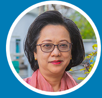
ARMIDA SALSIAH ALISJAHBANA Under-Secretary-General, United Nations; Executive Secretary, UNESCAP