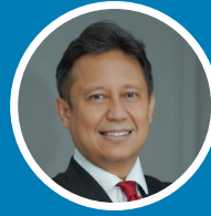
BUDI GUNADI SADIKIN Minister of Health, Indonesia